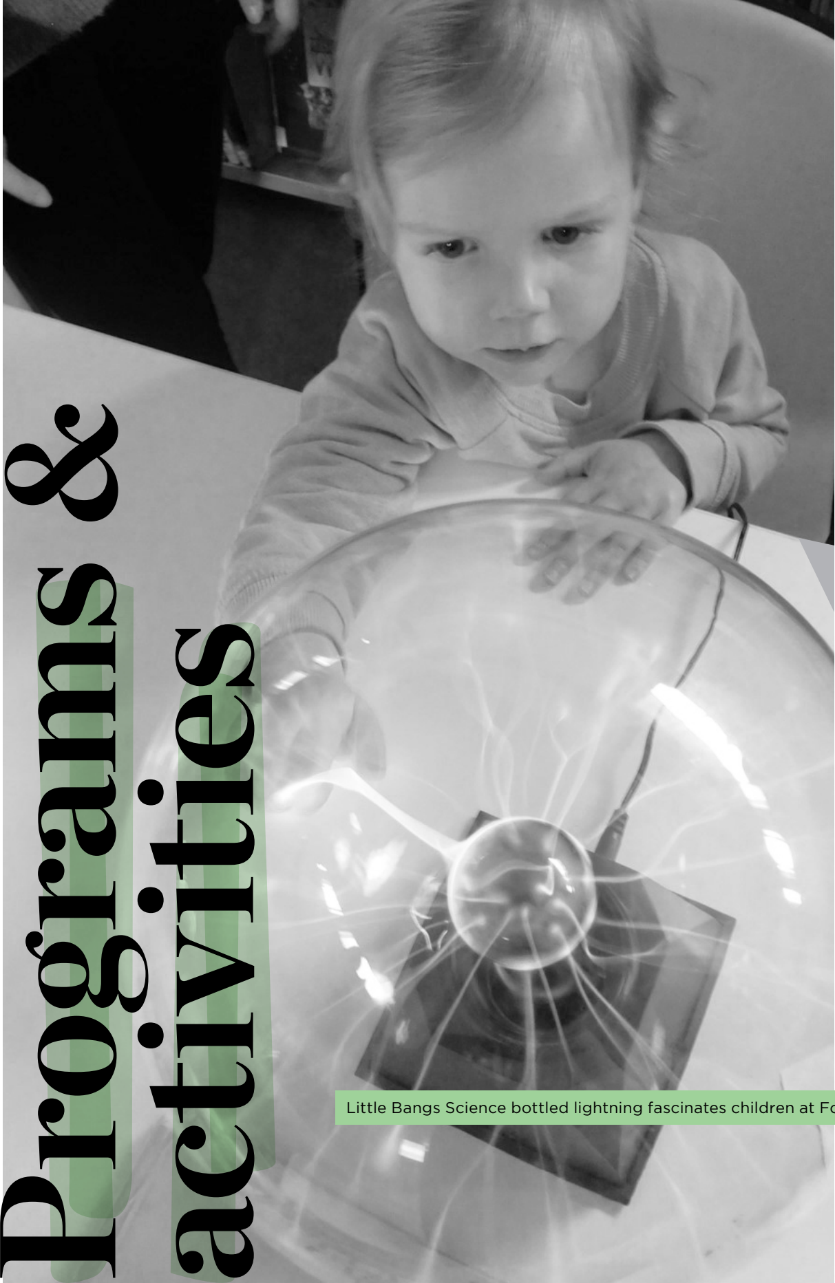
Little Bangs Science bottled lightning fascinates children at Forbes Library