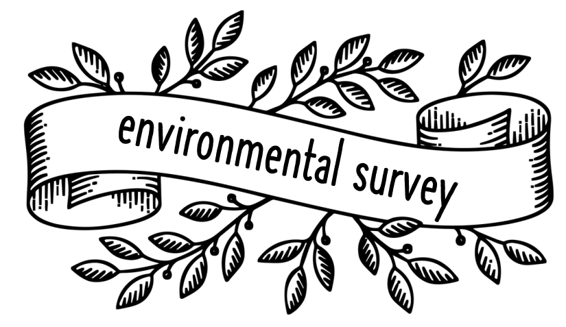
Go for a walk in your neighbourhood or a park, and look around. How many of these can you see or hear? Draw what you find or make tally marks.